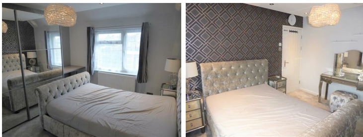
Rear aspect double glazed window, radiator, power point.