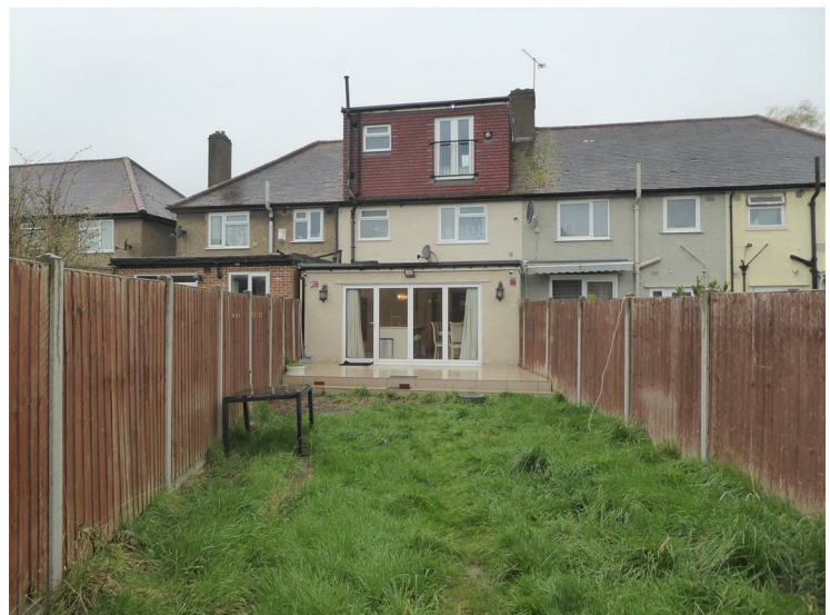
Paved patio area leading to mainly laid to lawn area.