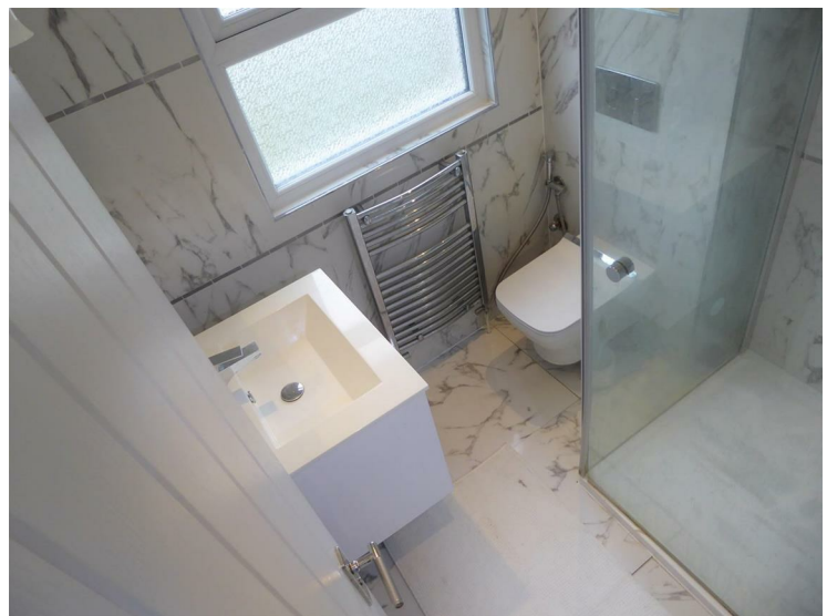
Tiled enclosed shower cubicle with wall mounted shower unit, wash hand basin with mixer tap, low level w/c, spotlights.