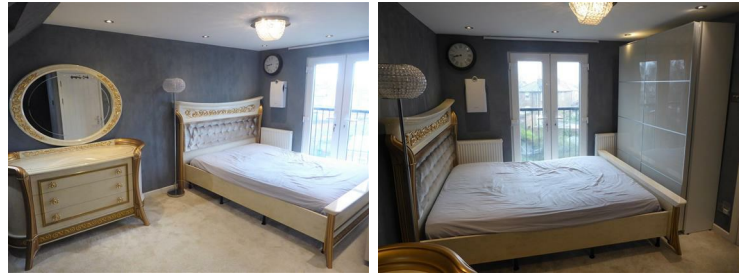
Skylight windows, radiator, double glazed doors to "Juliet" balcony, built-in wardrobes with further storage cupboards.