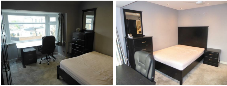
Front aspect double glazed window, radiator, power point.