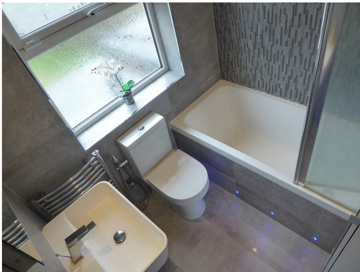
White suite comprising tiled enclosed bath, wash hand basin with mixer tap, low level w/c, tiled walls, rear aspect double glazed window, heated towel rail, tiled flooring.